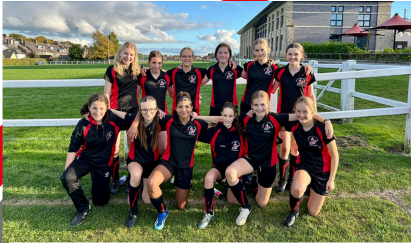
U13 Girls football team