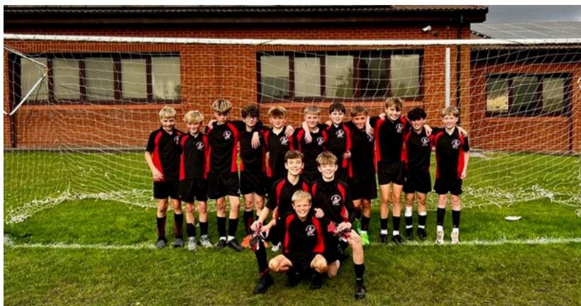
U13 Boys football team

It has been a very busy and exciting start to the term for HGS sports, with a wide variety of school fixtures across numerous sports. Both boys and girls rugby, boys and girls football, girls hockey, tennis, and cross-country have all featured prominently. A standout moment was the Saturday rugby fixtures at Harrogate Rugby Club, where all year groups participated, with many of the year 7 boys playing in their first-ever rugby match. Special recognition goes to the U14 girls hockey team, who reached the regional finals for the first time in the school's history. Additionally, both the U13 girls' and U13 boys' football teams secured impressive first-round wins in the National Schools Football Cup. It has been an action-packed half term with fantastic achievements across the board.