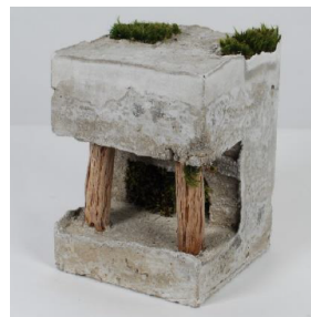
A sculpture against a neutral background