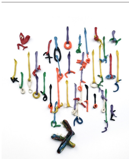
A Collection of Numbers (sculpture) by Ethan, aged 5

Have a look at the previous exhibitions on our website to give you some inspiration and here are some good examples of original ideas and interesting descriptions to get you started.