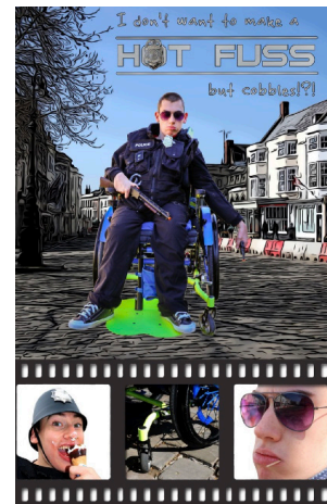
I Just Want To Be Seen (mixed media) by William, aged 18

This is me, the feeling of determination mixed with a sense of freedom and taking off into the air when I try to do a kickflip when I'm skateboarding. I wanted to focus just on my legs, the board, and the landscape around. It's the moment when you have to trust your legs and psyche yourself up to do this difficult move. I wanted it to feel full of movement and excitement.