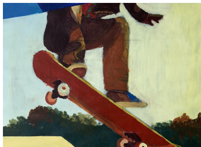
Here Comes the Kickflip (painting) by Oskar, aged 11

A collection of numbers were having a lovely day, when bad guy 7 comes along to eat them. But never mind, superhero 1 is going to save the day!